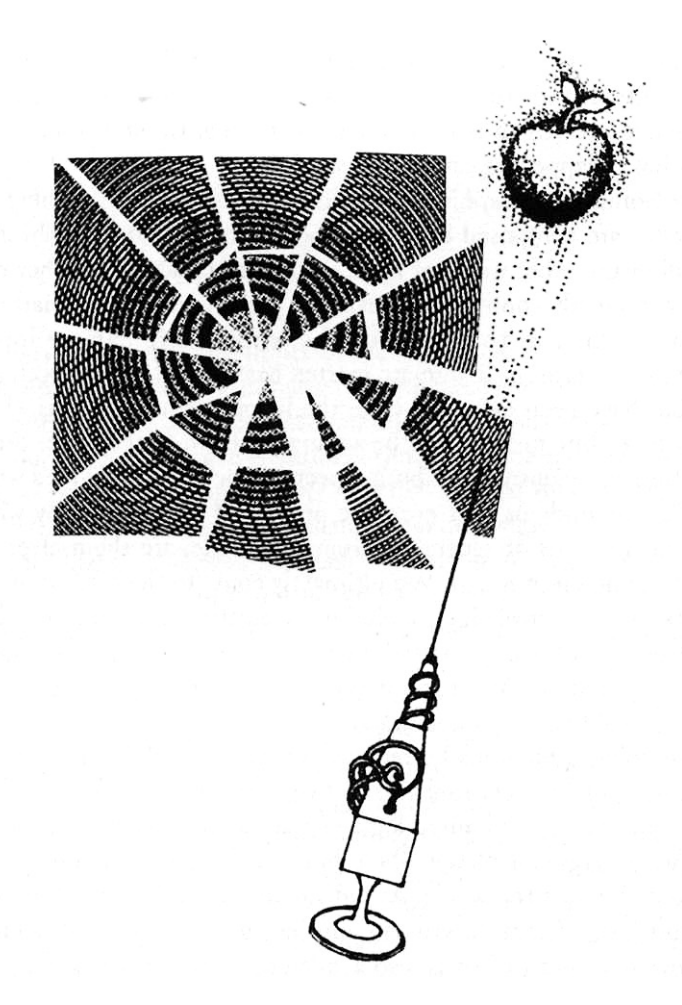
Figure 2. Unlike normal photographs, every portion of a piece of holographic film contains all the information of the whole. Thus if a holographic plate is broken into fragments, each piece can still be used to reconstruct the entire image.

gram) describes a level of reality that is not accessible to our senses or direct scientific scrutiny.